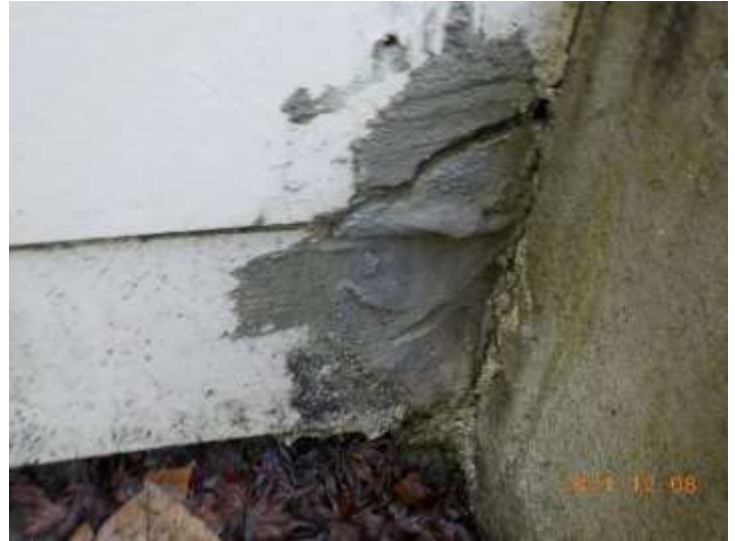
Improper repair of the siding located adjacent to the door to the Dining room