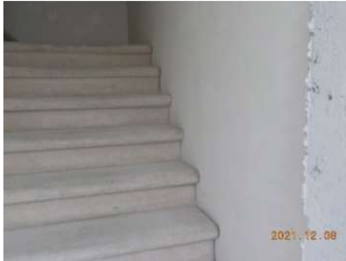
A graspable handrail is not installed

Barricades: A reasonable safety barricade is installed