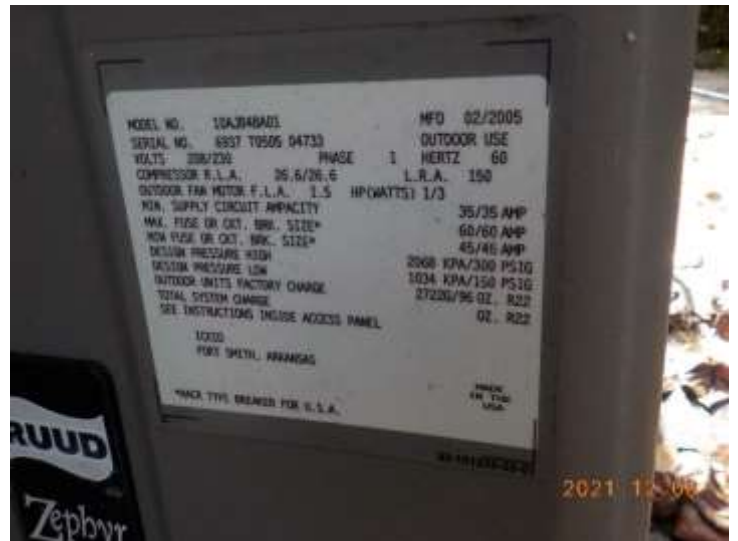
A/C system compressor information tag