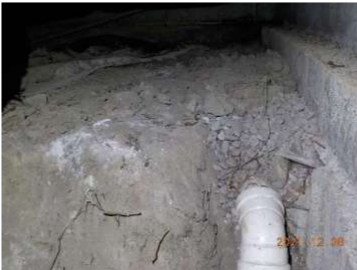
Missing vapor barrier