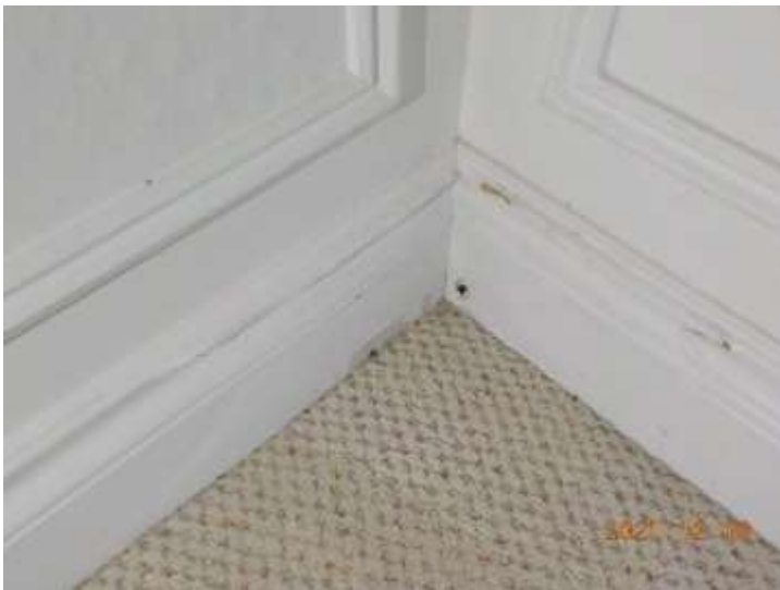
Swollen baseboards at the N.W. corner of the Dining room