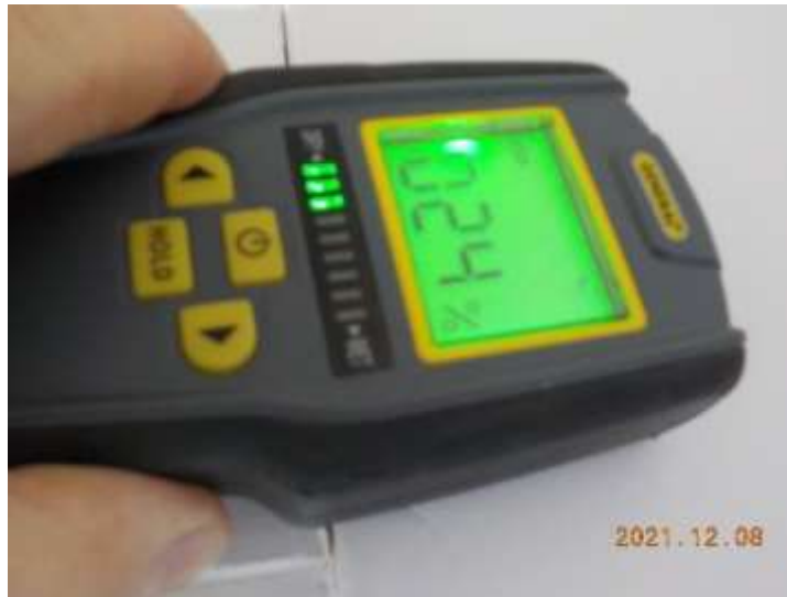
The moisture reading is slightly elevated