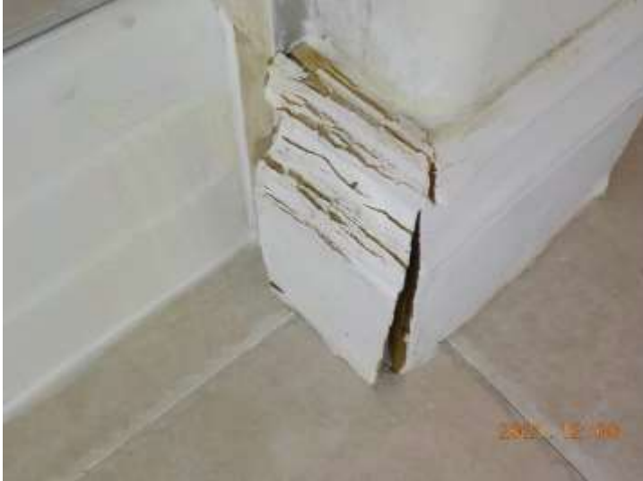
Moisture damaged millwork

Bath Hardware: No substantive visible defects identified