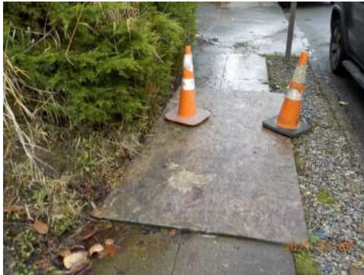
Plywood set on top of the sidewalk

Other: - A water feature appears to be installed at the rear yard. This system was not active at the time of the inspection, therefore not inspected or tested. - Seller: explain the plywood placed over a portion of the sidewalk at the front of the lot. Water is running out from this area. Note: the water meter for this home was not located.