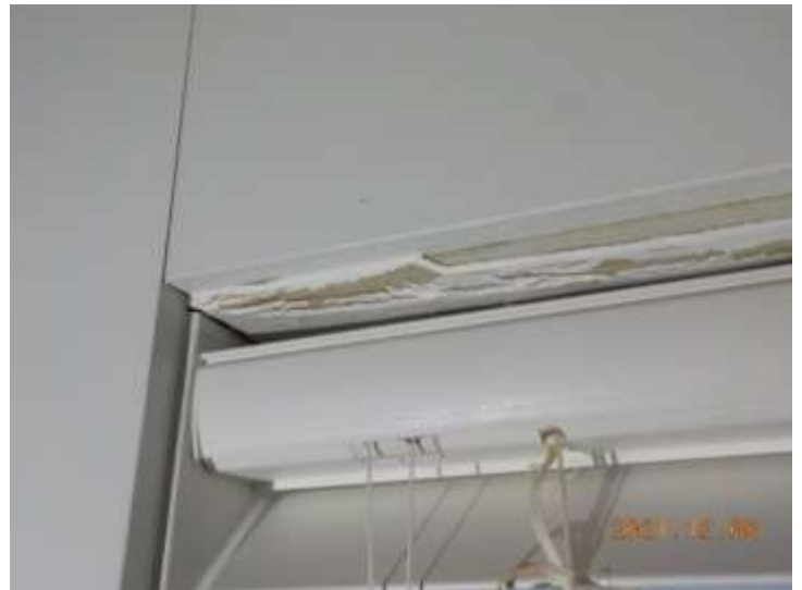
Evidence of prior moisture intrusion at the S.E. windows