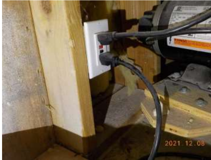
The tub motor is GFCI protected at the electrical outlet located below the tub (accessible thru the cabinet)