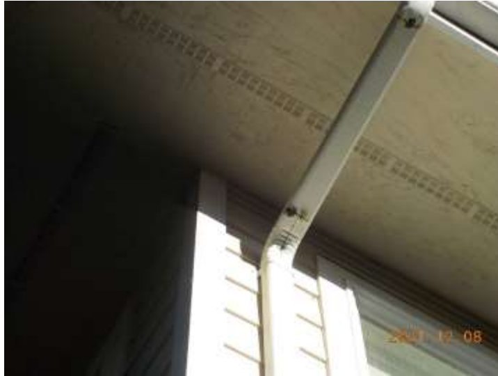
Leakage from a gutter