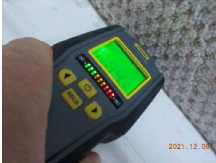
High moisture reading