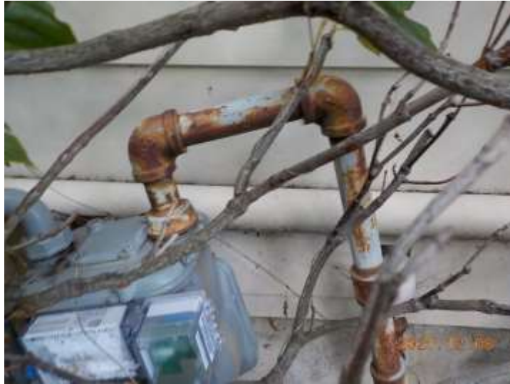
Rusting gas pipes

- The exterior gas pipes should be coated with rust proof paint.