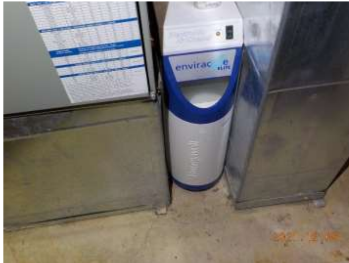
Furnace filter location

Note: The condition of the furnace filter is not a part of an inspection. A new filter should be installed when moving into the property.