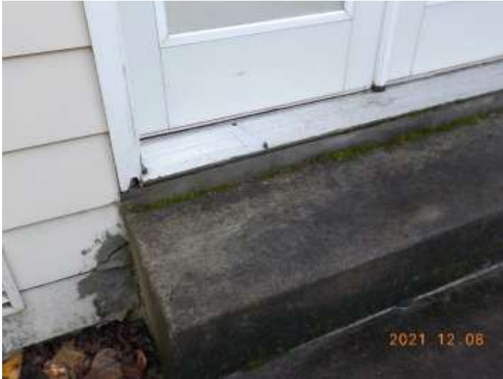
See image to right