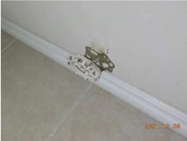
Domestic water shut off

Measured water pressure: Not measures as pressure washing is in process