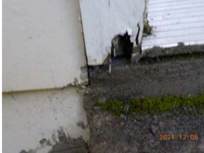
Rotted door jamb

Windows (ext. cladding): No visible defects identified