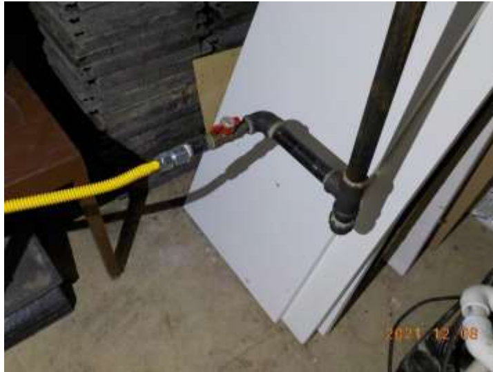
A proper gas shut off valve and sediment trap are installed