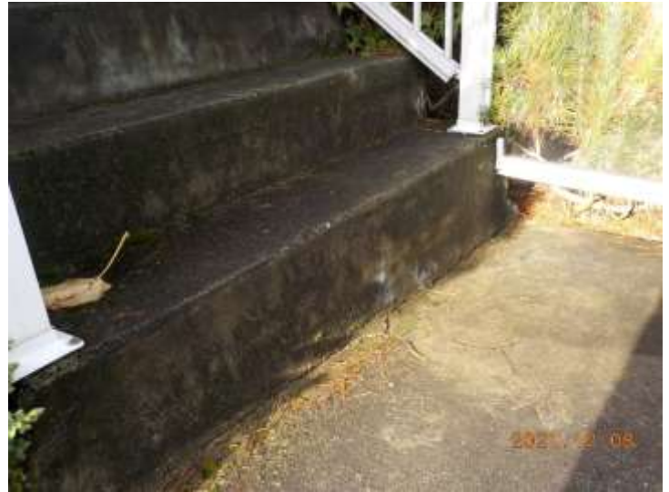
The mid landing appears to have settled