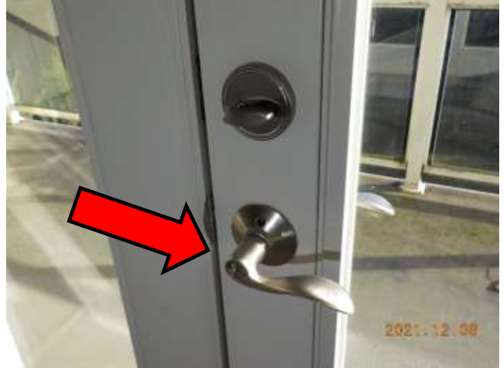
This type of lock can result in accidental lockout on the deck