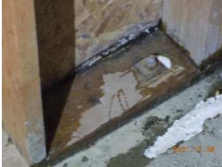
Standing water at the wall adjacent to the mechanical room. Minor wood rot is visible.