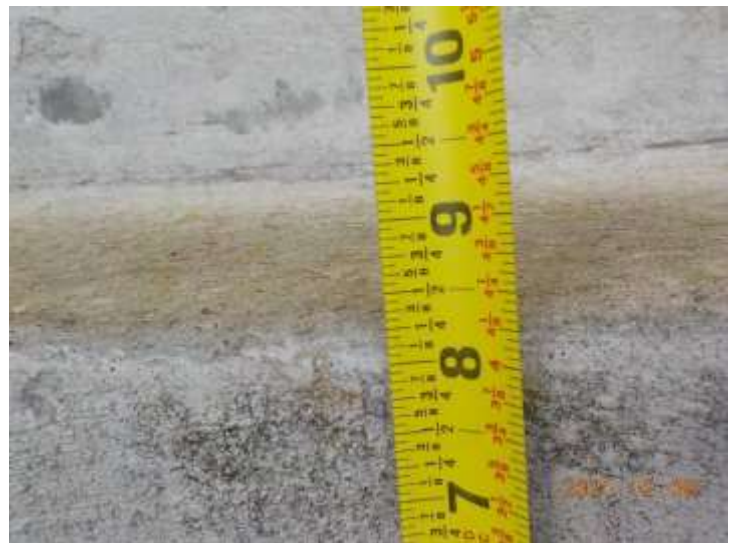
Most riser heights are > 8"