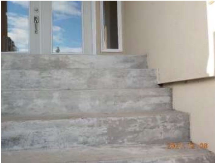
A graspable handrail is not installed

Barricades: A reasonable barricade is installed