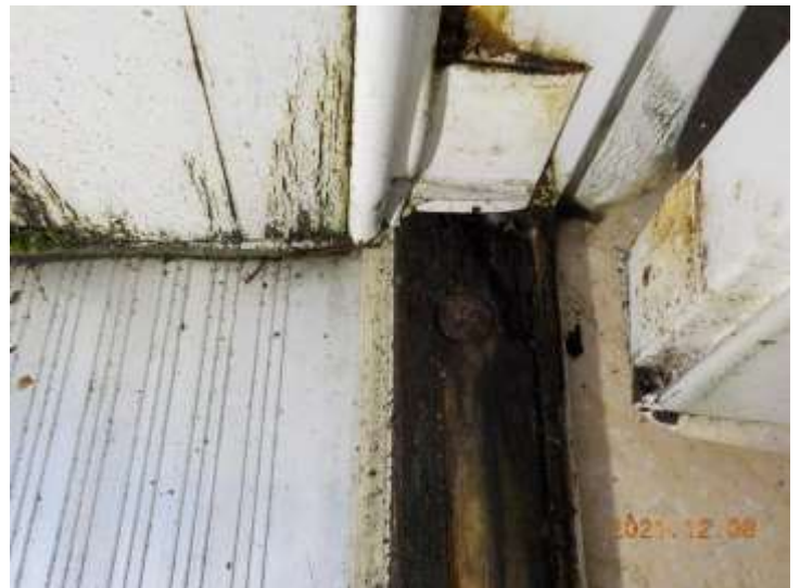
The door jamb and threshold are rotted