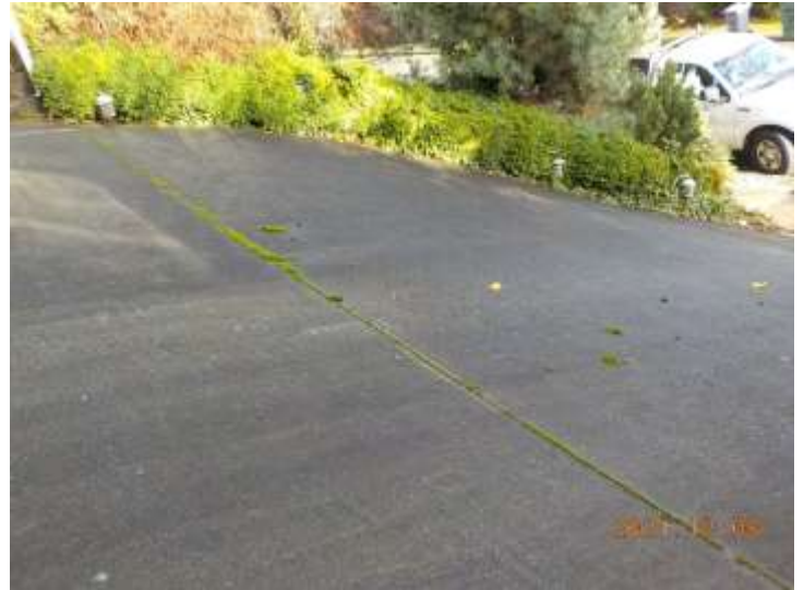
The grade of the driveway is very steep. Some cars may “bottom” out when driving from the street into the garage