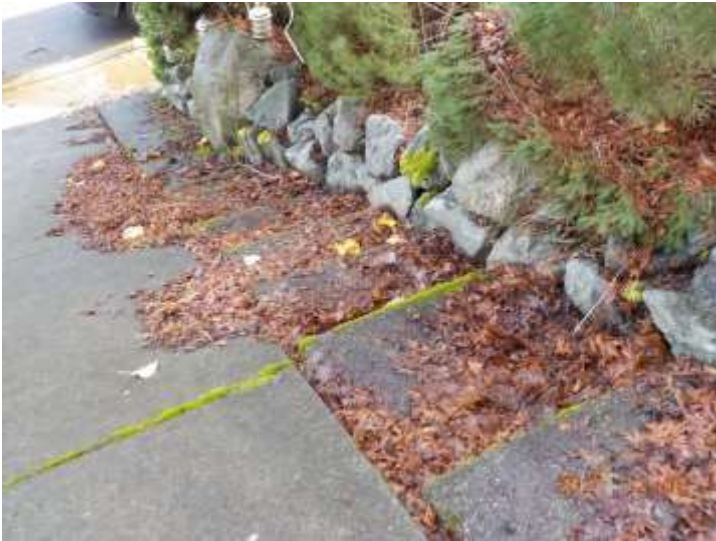
Steps from the sidewalk to the garage