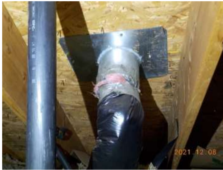
Bathroom ventilation duct (typical)

Roof Ventilation: Appears adequate Moisture Intrusion: No visible evidence identified Bathroom Vents: All vent to the outside where visible (limited visibility)