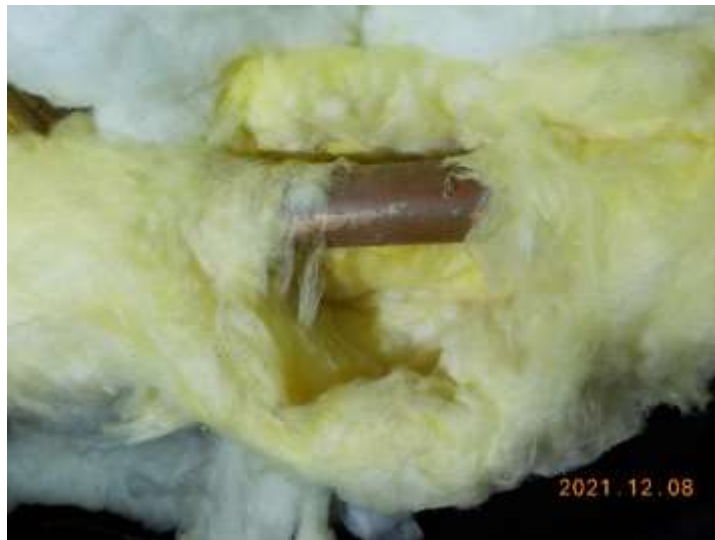
Domestic water distribution pipes