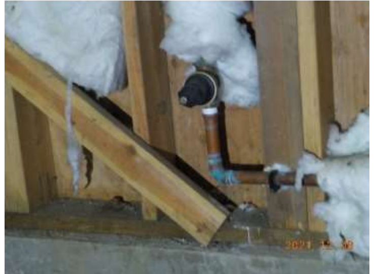
Pressure reducing valve @ crawlspace