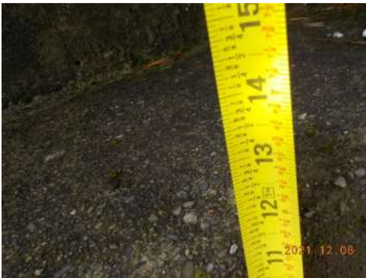
The 1 st riser from the mid landing is 12" +/-