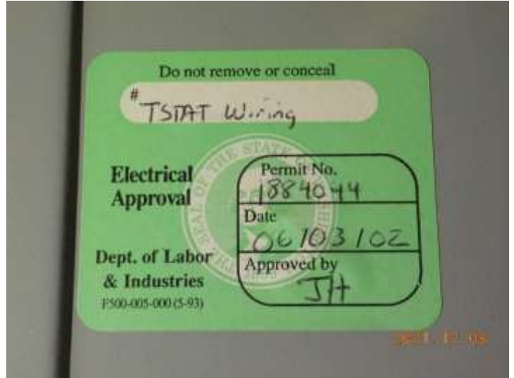
Electric service permit tag